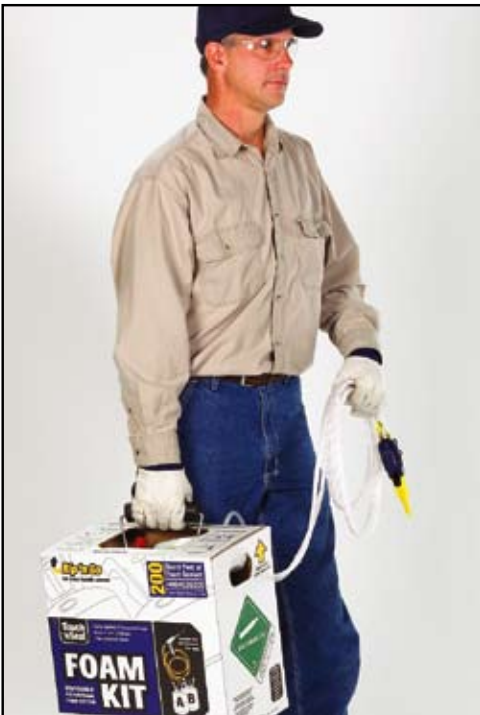
Portable and disposable, Touch 'n Seal Foam Kits are easy to move around the job site.