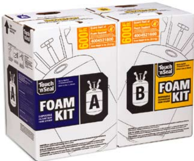
Multiple sizes and formulas available.