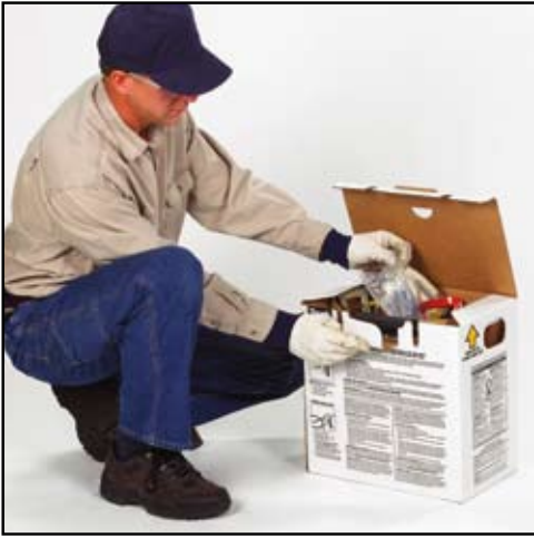
Self-contained units feature fast, easy set-up.