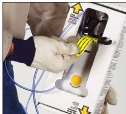
Fast, easy set-up.